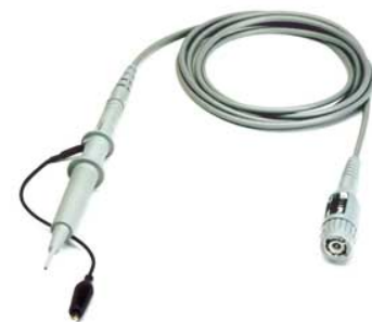
10076A Passive Probe