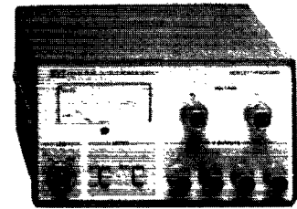
Dual Output: HP 6234A