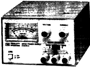
Single Output: HP 6212C-6218C